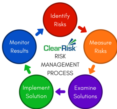
Figure: Risk Management Process